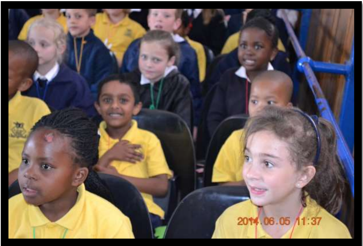
B-Sure Private School